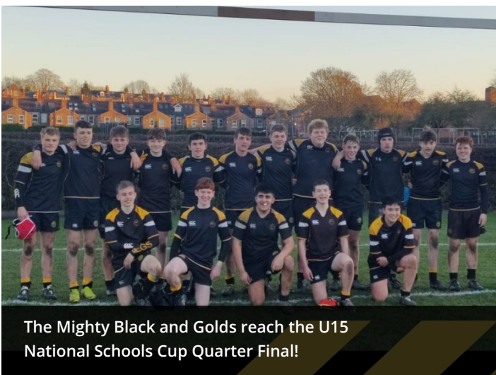
The Mighty Black and Golds reach the U15 National Schools Cup Quarter Final!