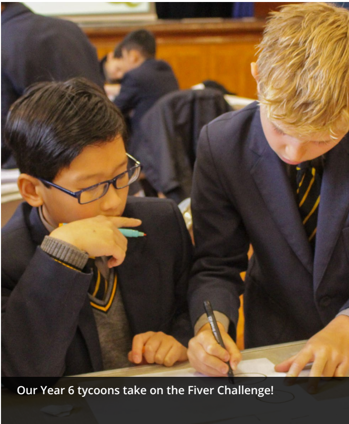
Our Year 6 tycoons take on the Fiver Challenge!