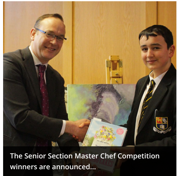
The Senior Section Master Chef Competition winners are announced...